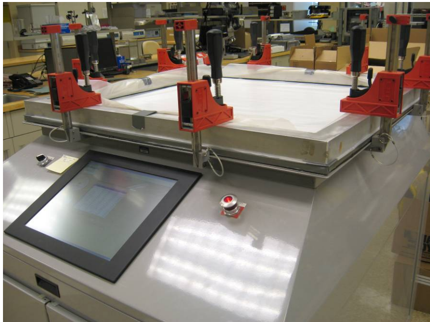
Photo No. 2 Air Permeance Machine at Test Completion